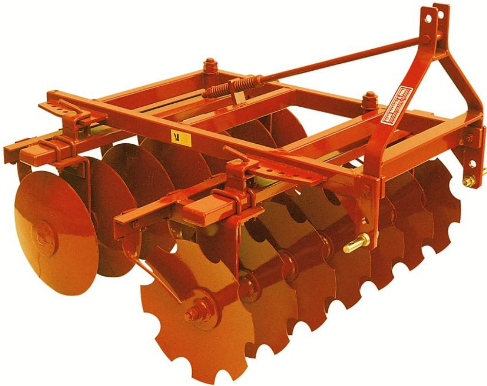
Frangizolle a 2 sezioni a V portato Herse deux sections porte Pulverizer two "V" shape sections mounted