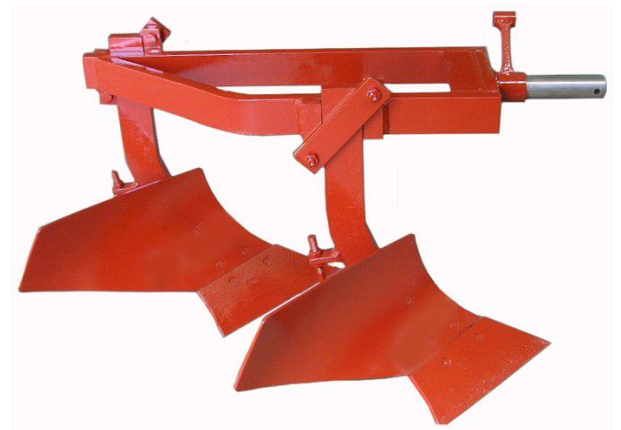
Aratro bivomere 2D Charrue bisoc 2D soc ordinaires Two furrow plough 2D standard share