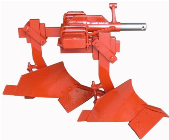
Aratro bivomere 2PV-S Charrue bisoc 2PV-S soc à carrelet Two furrow chisel plough 2PV-S